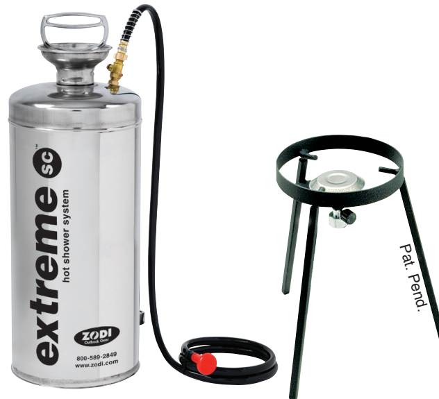
8170 Extreme Self Contained Shower with Multi-use Propane Stove (propane not included)

Read Directions Before Operating Follow Directions at all Times